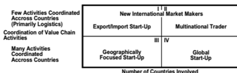
Face 1: Classification of the INV (International New Venture)